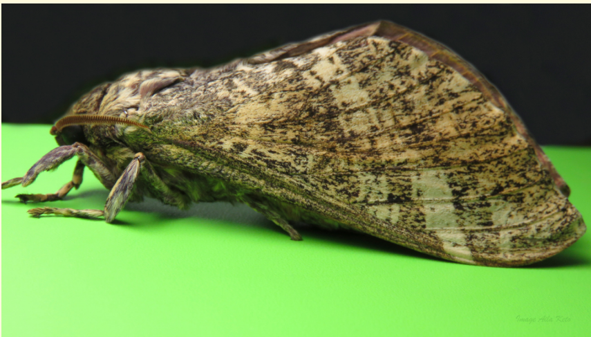
Oxycanus buluwandji (Hepialidae)

Oxycanus buluwandji Tindale 1964 (Hepialidae, Hepialinae). Photo 28 April 2016.